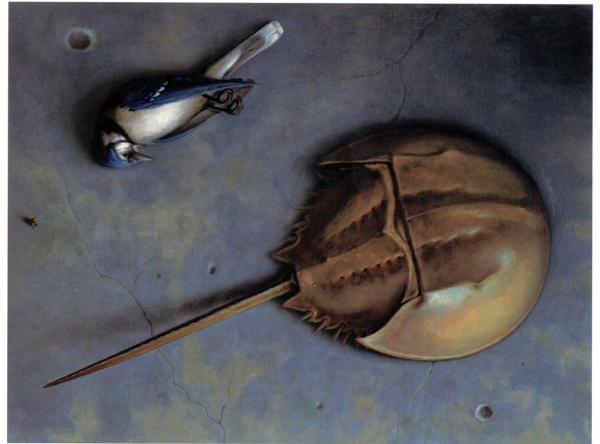
Horseshoe Crab, Bird and Fly , 2003, oil on linen, 17½ x 23 inches