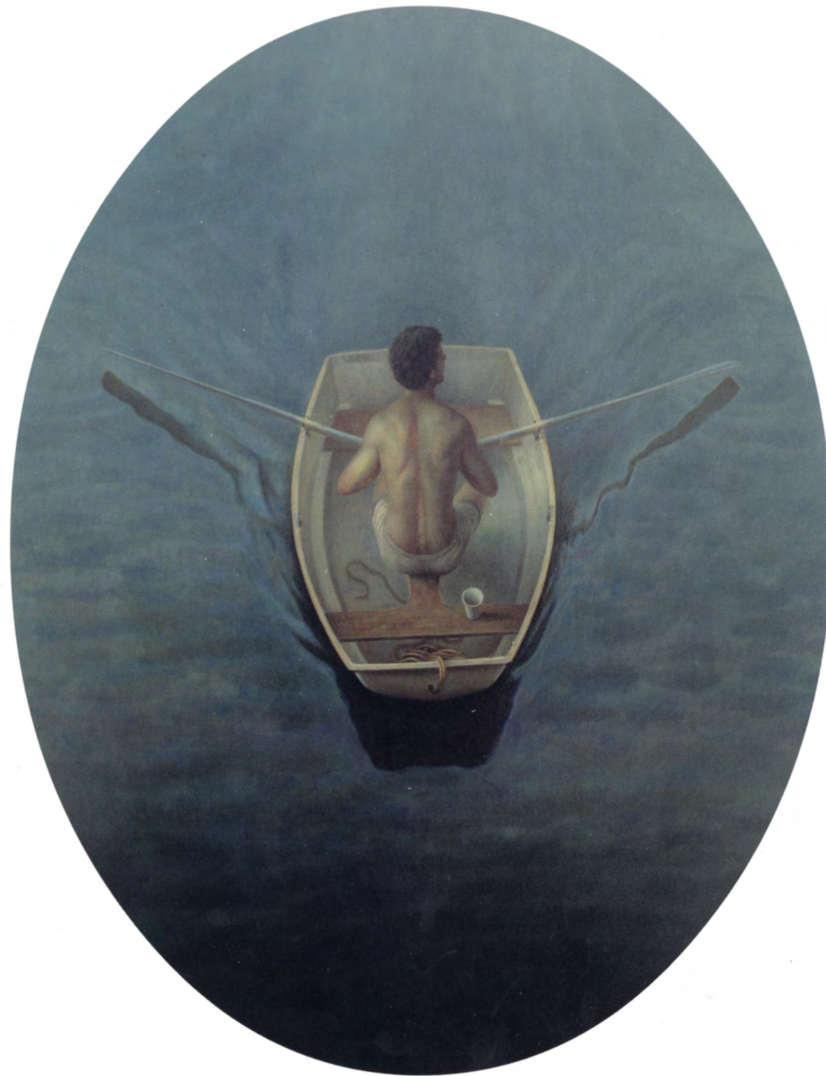
Passages (Rowing Man) , 1998–1999, oil on linen, 66 x 48 inches, Courtesy Forum Gallery