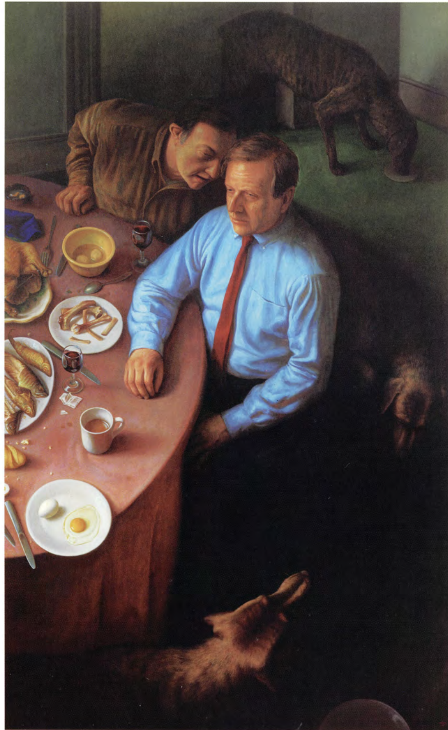
Conversation , 1996–1997, oil on linen, 65 x 40½ inches, Collection of John McIntyre