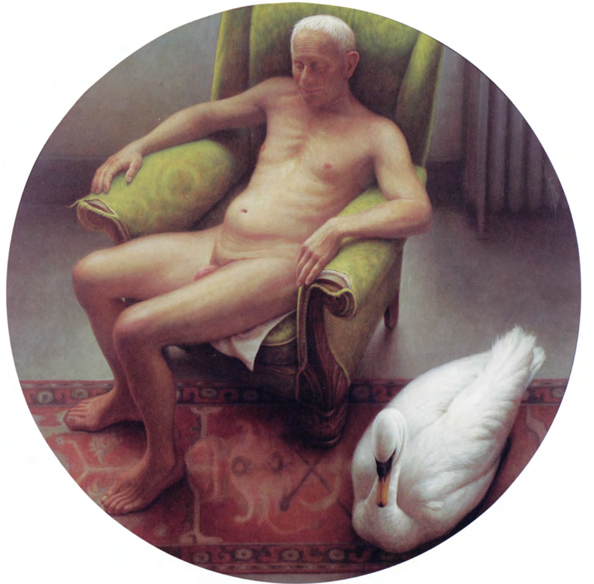
Man with Swan , 2001, oil on linen, 48 inches diameter