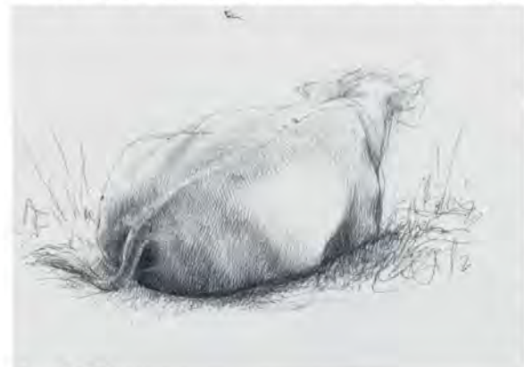
Cow , 2003 ballpoint pen on paper, 7½ x 10¾ Collection of the artist

Painters who show drawings can sometimes feel strangely exposed. There's no place to hide in a drawing, no conceptual scaffolding to hang onto, nothing to distract from what is right there on the page. For every drawing Schuman keeps and exhibits, there are many that end up in the trash and many others that slumber in flat files or in the back of old sketchbooks. Some of these were private investigations, never intended to be seen by anyone else. "Drawings are like underwear," he commented not long ago. "They're under there and they might be really beautiful, but you don't necessarily see them. They're sexy and hidden; but you might also just crumple them