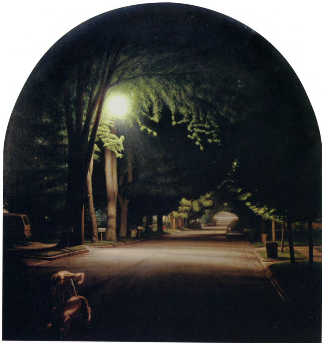
Passages (Conflict) , 1996, oil on linen, 37½ x 35½ inches, Courtesy Forum Gallery