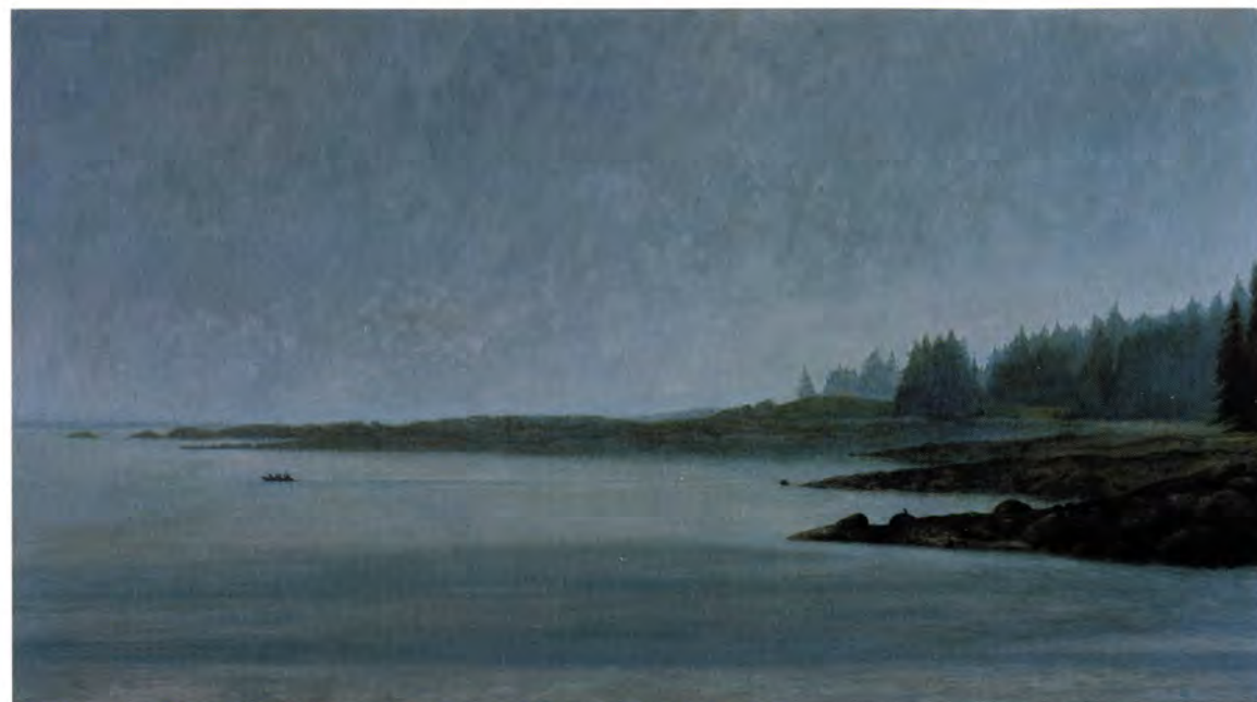
Departure , 2002–2003, oil on linen, 27 x 48 inches