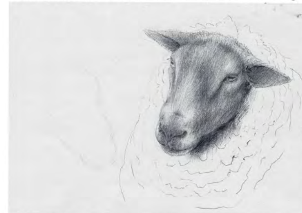
Old Sheep , 2003 ballpoint pen on paper, 7½ x 10¾ Collection of the artist

Every afternoon for several weeks, he set out for the sheep's pen carrying a flimsy plastic chair, a sketchbook tucked under his arm. Drawing animals has a long tradition at the Chateau de