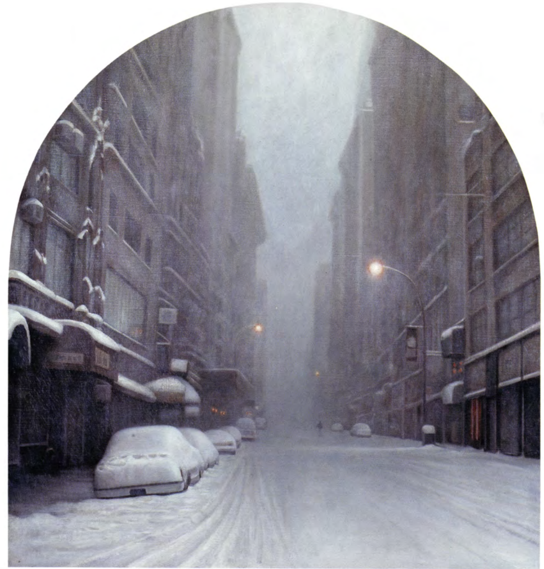
Passages (Resolutions) , 2001, oil on linen, 37½ x 35½ inches, Courtesy Forum Gallery