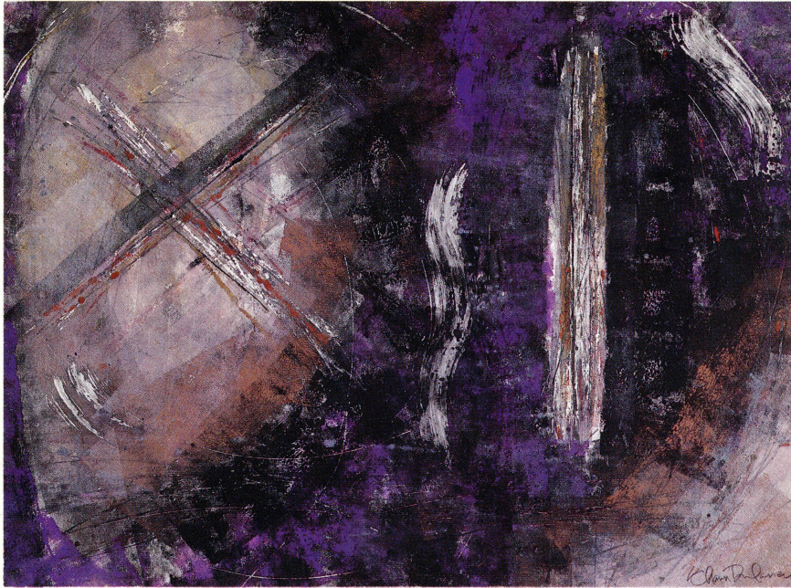
Discernment , 1990 Monotype, 30 x 40 inches

In trusting a certain lack of control, each new work emerges. I don't know the paintings when I first paint them. They each have a distinct personality which I get to know as we interact. It is not one sided. I start with a clear idea, then the painting suggests another direction. It pulls me one way, I push it another. After struggle and discovery it emerges as its own entity. The paintings prove to be a projection of what is occurring in me but has not yet consciously appeared. Painting is a realization of my own immensity and insignificance.