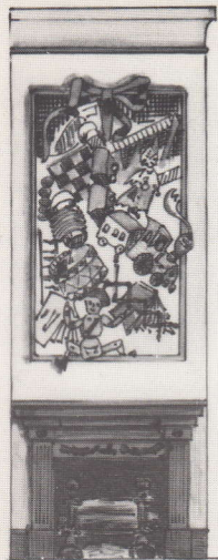
SR #1 FLATS