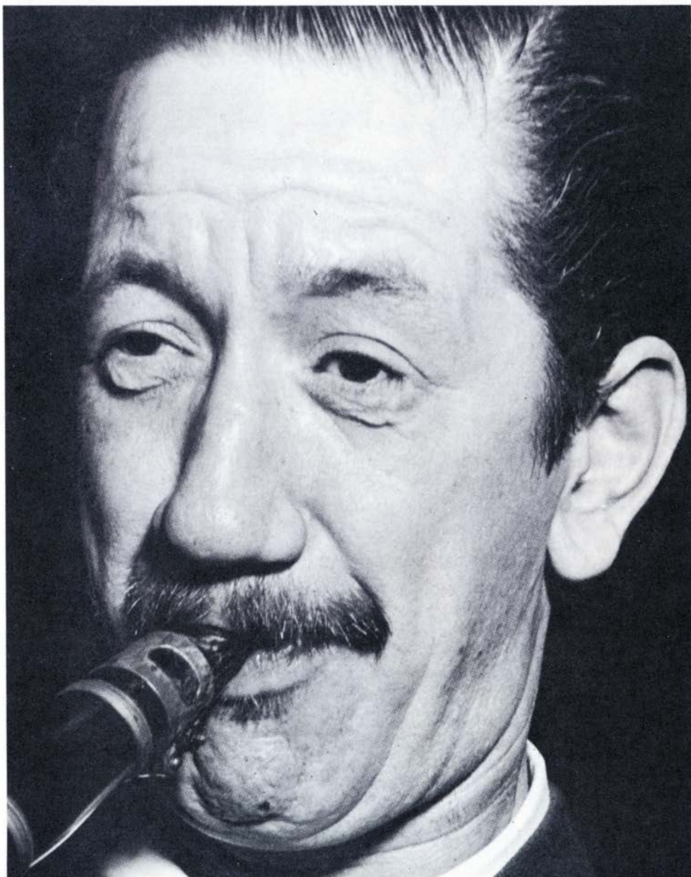
Photograph of Pee Wee Russell