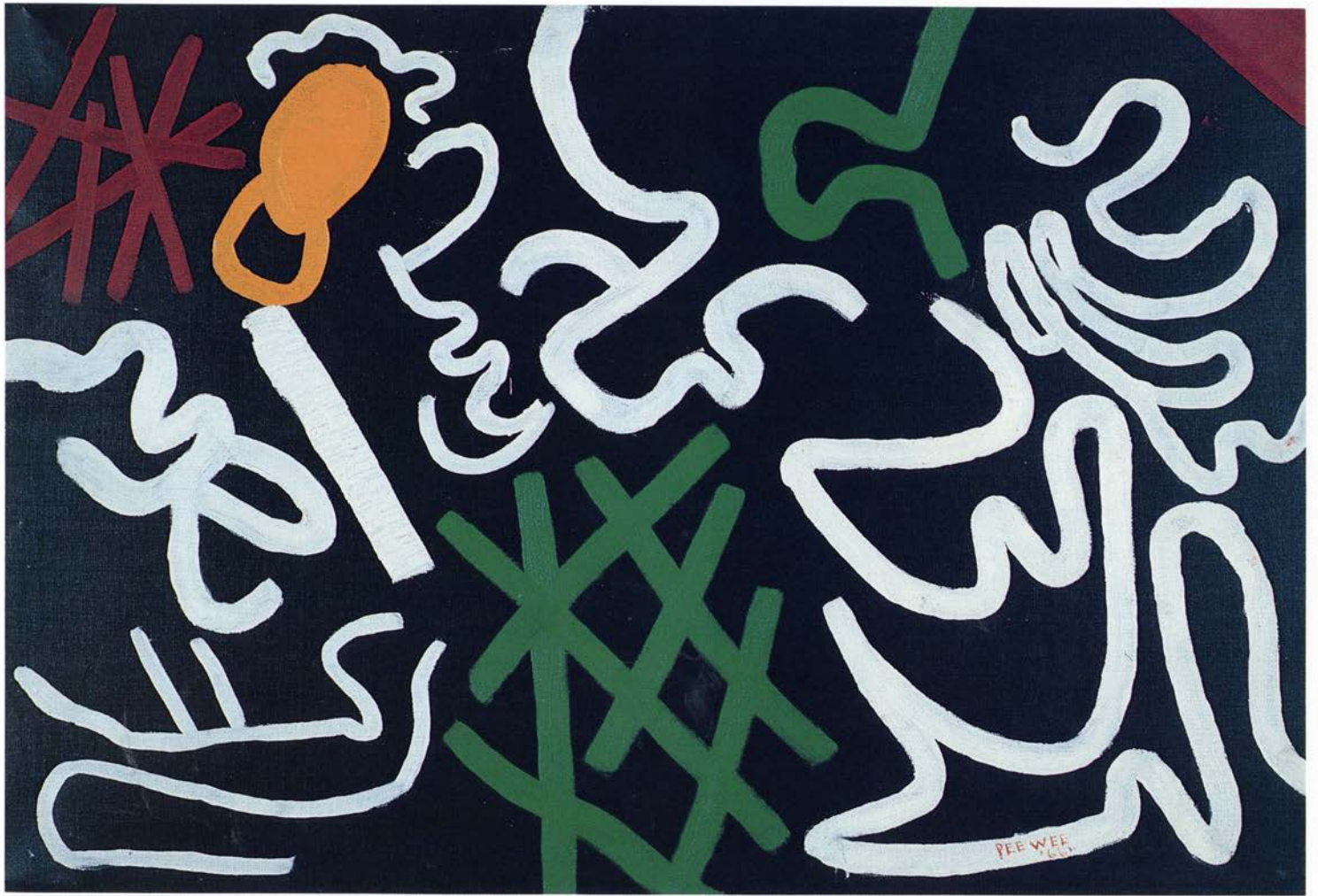
8. Pee Wee Russell, Ditto, 1966