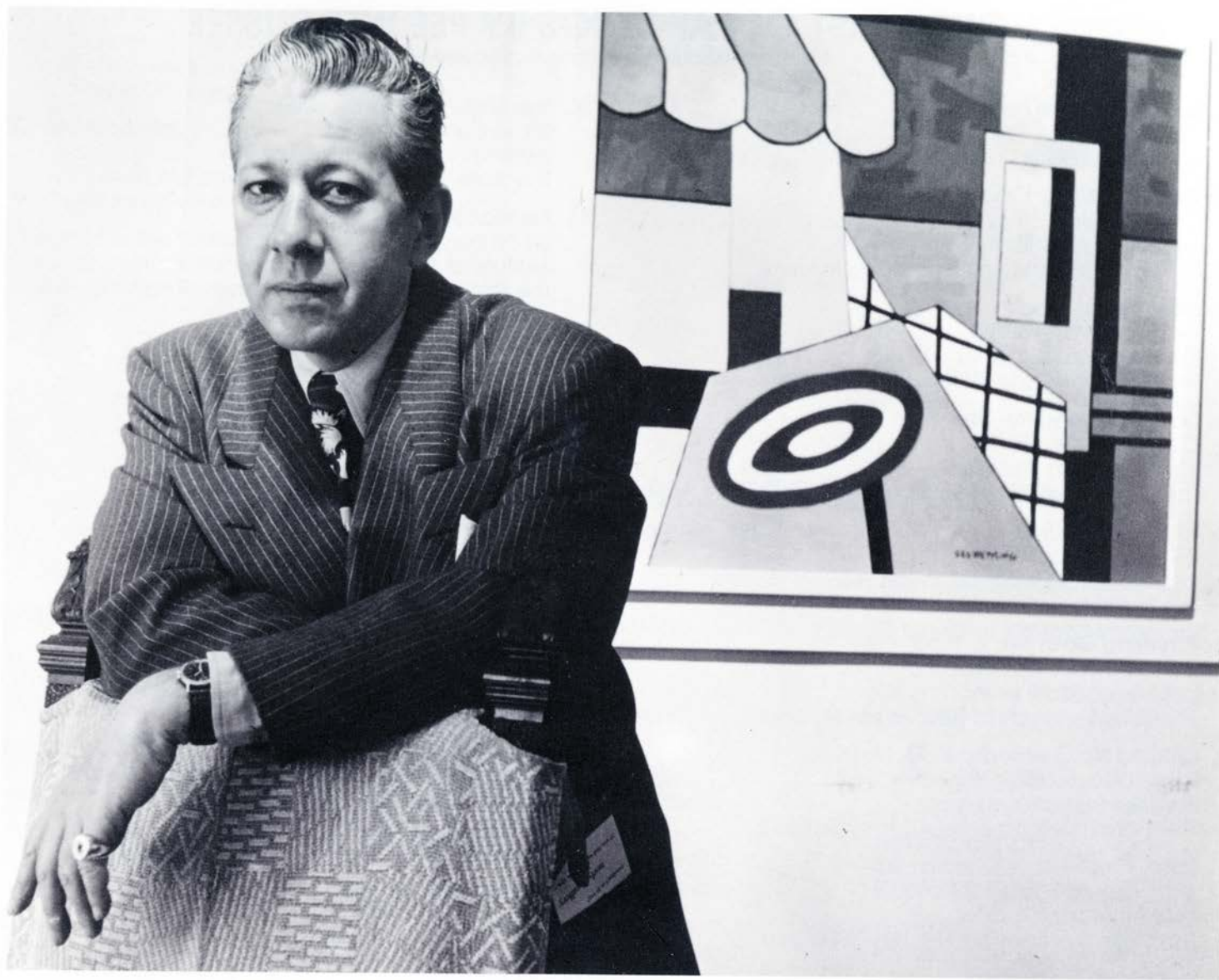
Photograph of George Wetling