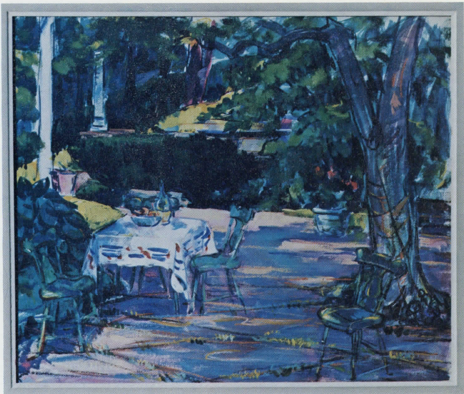
43. Al Fresco