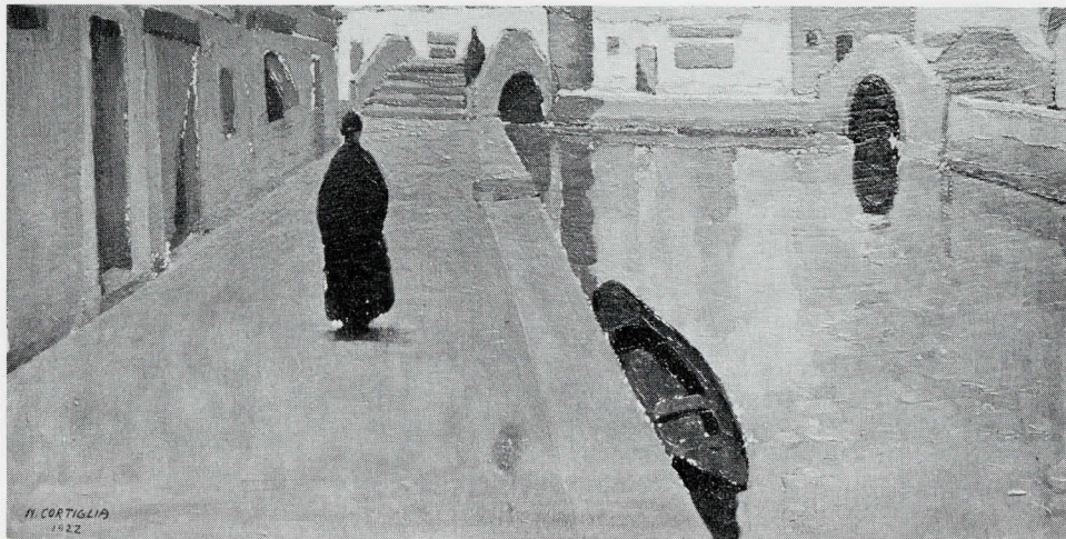
42. The Bay of St. Mark's Venice