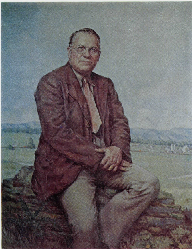
21. Senator A. J. Sordoni