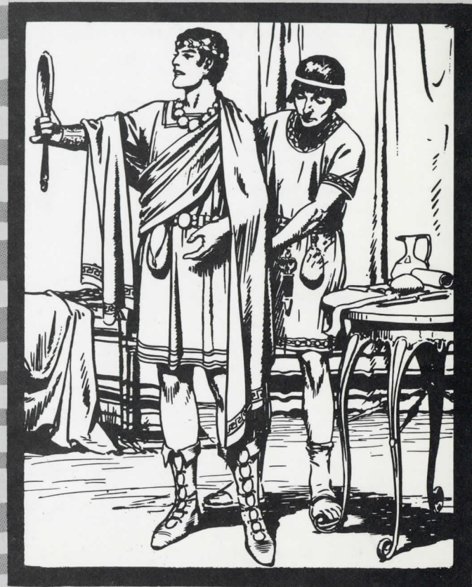
HAL FOSTER, Prince Valiant

• Wilkes College • Wilkes-Barre, Pennsylvania 18703 • (717) 824-4651