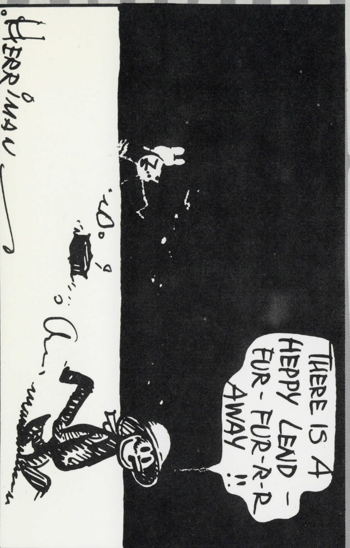
GEORGE HERRIMAN, Krazy Kat

Since the final size and coloring (if any) is accomplished in the printing process, all of the art work is being shown in its purest, most original form, i.e., fully inked, cleaned and corrected exactly as the publisher receives it from the artist.