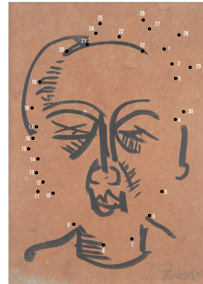
Untitled, David C. Driskell

David C. Driskell used line in his drawings and paintings to show how he saw the people and landscapes he was portraying.