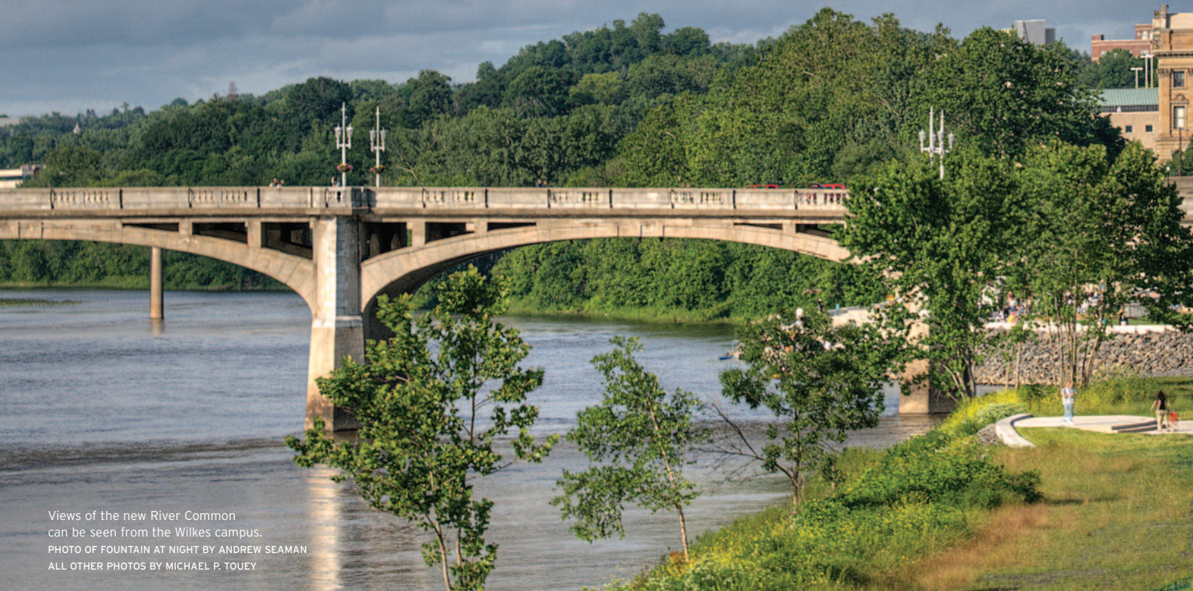
Views of the new River Common can be seen from the Wilkes campus.