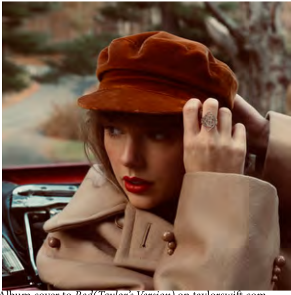
Album cover to Red(Taylor's Version)

Speaking about her new album Red , Swift has added an additional ten tracks that were unreleased. She labeled some of her new songs as "from the vault" expressing that these songs didn't make the cut. The song known as